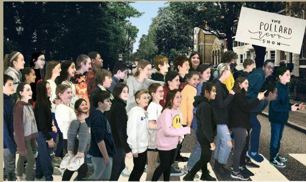
Seasons 1 and 2 of Pollard News