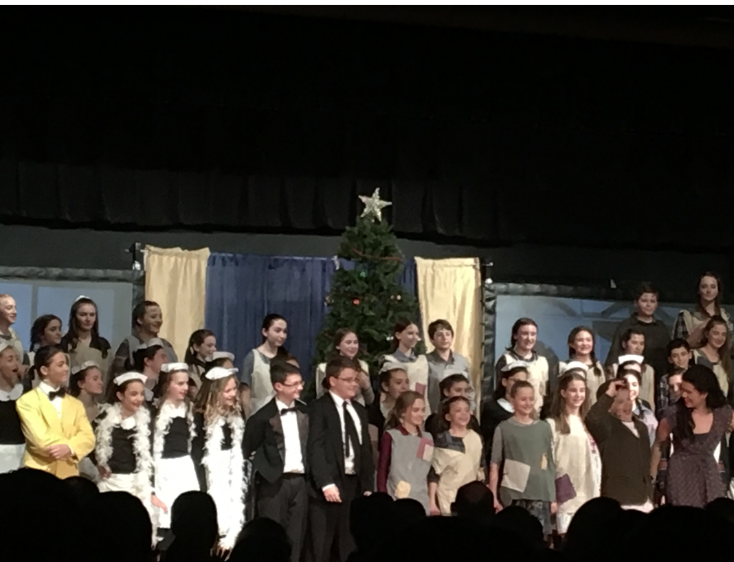
The whole Annie cast takes a final bow at the end of the production