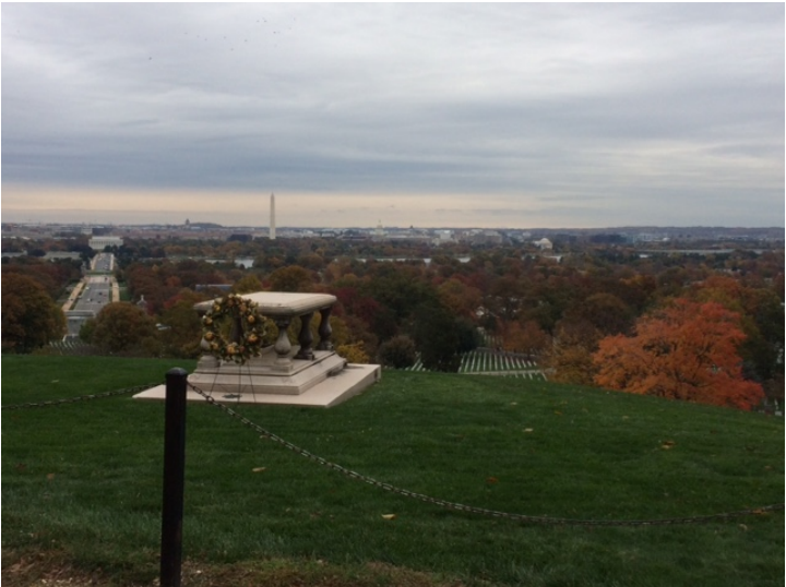
Pictures of some of the clusters at Arlington National Cemetery.